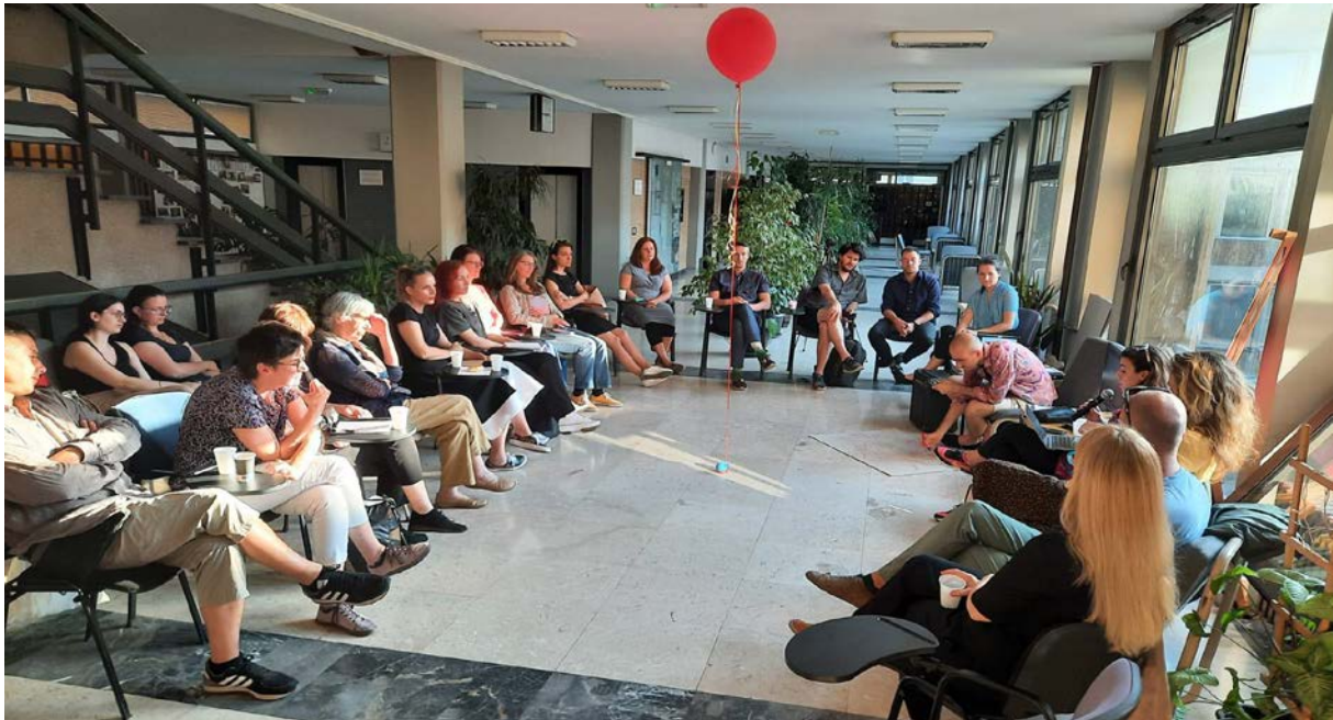
Reflective talk – ‘The game begins when we show up!’ was held as part of the program Conversations between the Department of Pedagogy and Andragogy of the Faculty of Philosophy in Belgrade .

The results of this approach so far have strengthened children and young people, encouraged their imagination and independence in work and life, but also empowered in exercising the right to public spaces and, more importantly, safe and authentic play.